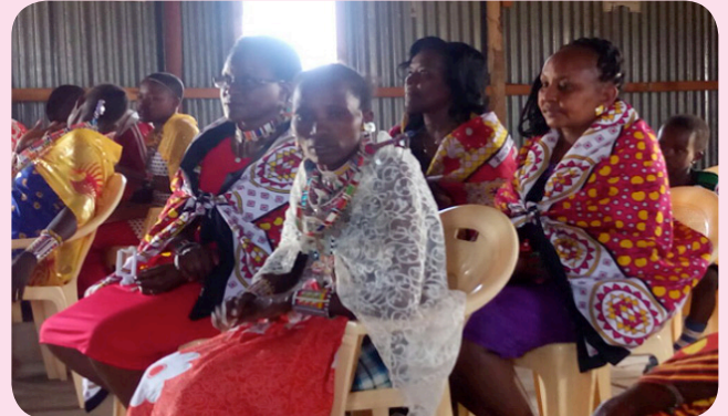
A session on early detection and treatment in Inyonyori, Kajiado County.