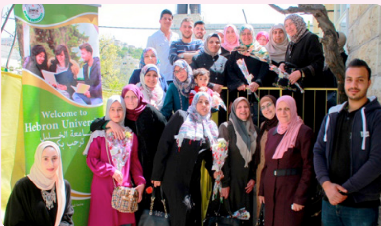
A joyful gathering of Hebron University students in support of members of the Sunrise Group in Hebron. The women are from all walks of life, some under treatment while others are longer-term survivors.