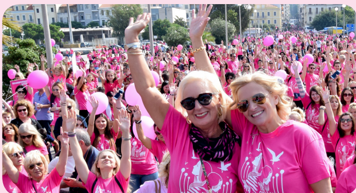
Breast Cancer Walk