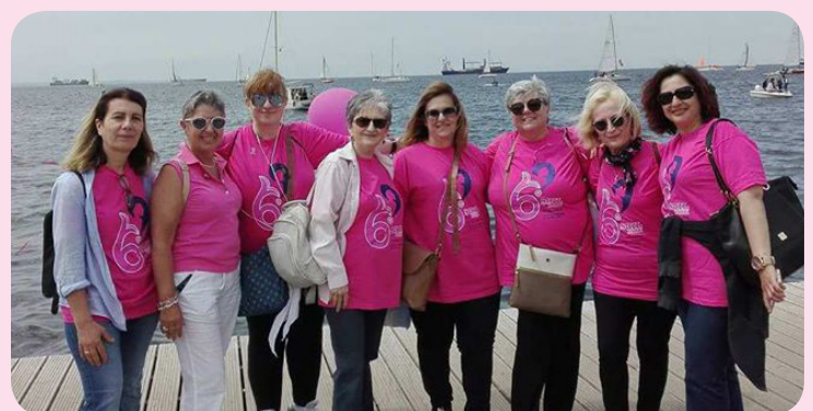
Sale for Pink