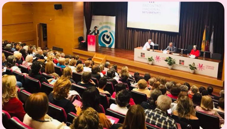
3rd National Meeting open session