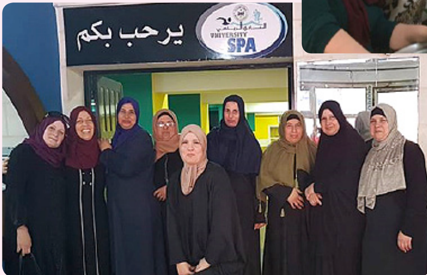
Sunrise group members in Palestine are preparing for exercise and swim classes.

Social support and coming together (a sisterhood of sorts) really make a difference for cancer patients and their families. Here members of the Patient's Friends Society's Sunrise Group are getting ready to cook lunch for a big gathering at our Palliative Day Centre in Hebron.