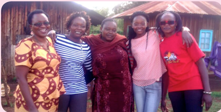
Photo to remember a successful women's group discussion in Ruiru, Meru County.