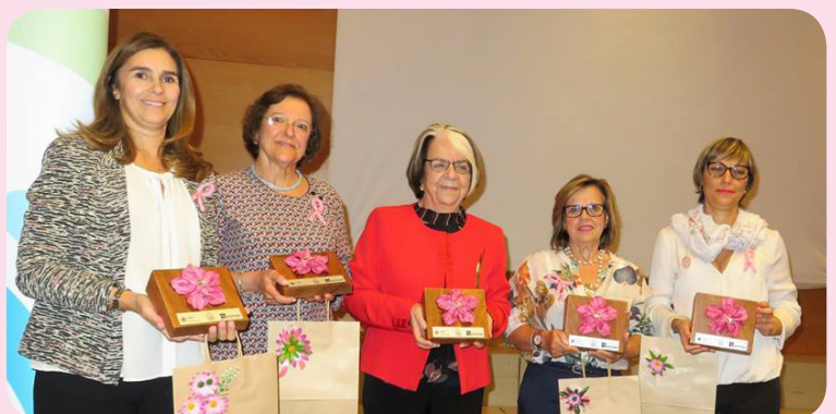
Thank you gifts given to the 5 Nuclei Coordinators