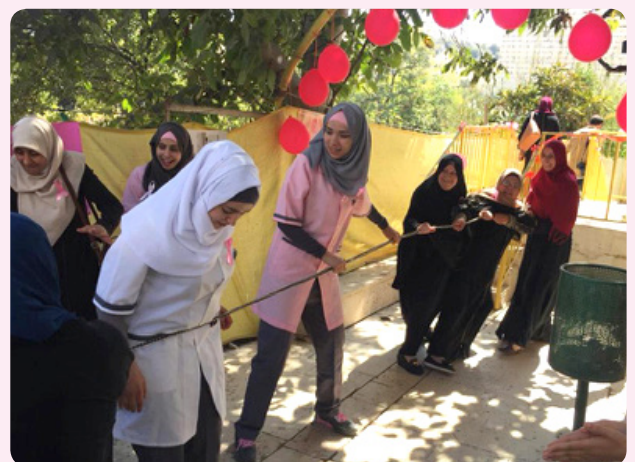
Hebron University Nursing and Midwifery students spend the day with our cancer support group members, creating a fun day of physical activity. Raising awareness about lifestyle changes and empowerment is so important!