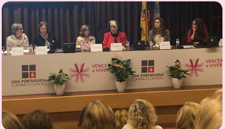
Meeting of the 5 Nuclei Coordinators