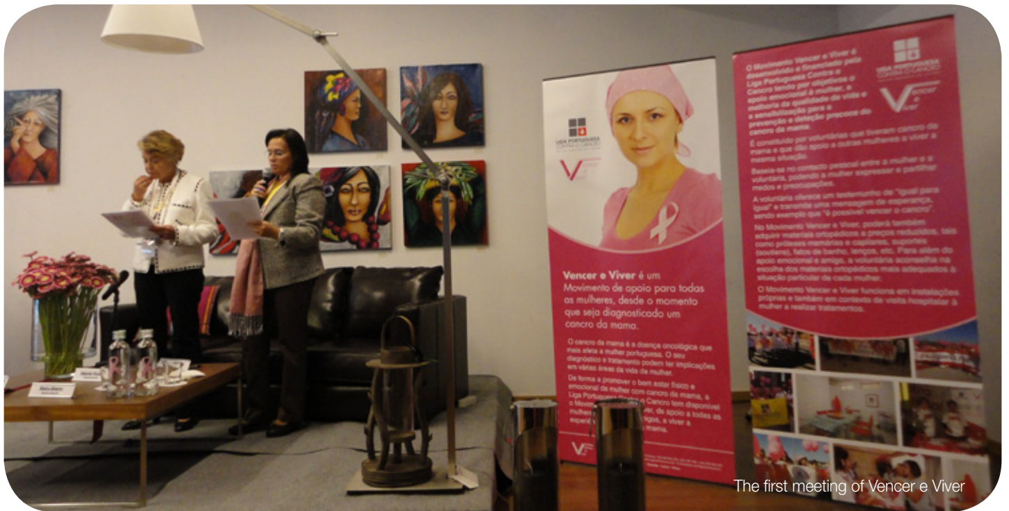
The first meeting of Vencer e Viver