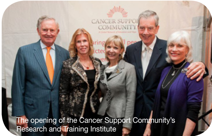
The opening of the Cancer Support Community's Research and Training Institute

Its expanded services and research capabilities enable CSC to influence policymakers with scientific data, grassroots mobilization, and national advocacy network and a broader, engaged cancer community. Non-profits don't have to resist the coming changes to the healthcare system, but instead see it as an opportunity to rethink sustainability and the path to achieving the organization's mission.