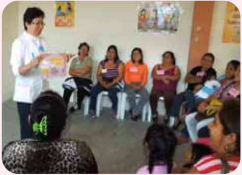
Peruvian women take part in a public education workshop on breast cancer and breast health during a BHGI site visit in 2012.

diagnosed with breast cancer in Tanzania die of the disease.