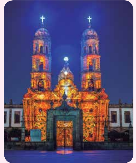
Basilica de Zapopan