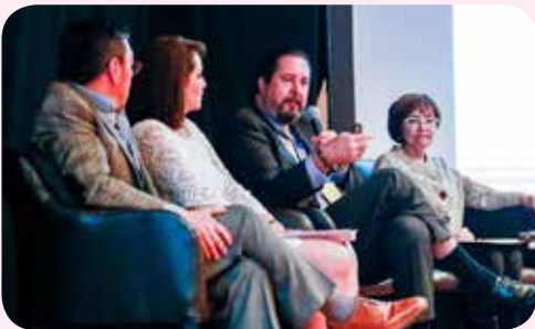
Volunteering forum organized by Corporativa de Fundaciones.

the community and empower the most vulnerable members of society. Since its establishment in 1999, CF has identified many of the problems facing CSOs working in social spheres. It helps CSOs expand their technical knowledge and management and leadership skills so they can better address societal needs and interests. CF's main purpose is to strengthen and sustain innovative social projects and programs with a human rights and evidence-based perspective. It transfers skills and capacity building to members of CSOs to help them better respond to the most pressing issues