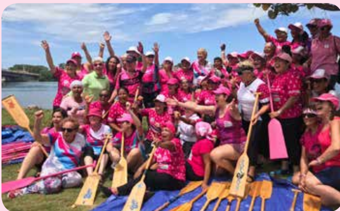
Colombian novatas [novices] enjoying their friendship with outreach team members from AIAB and other IBCPC teams.