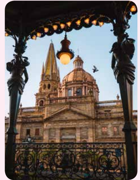
Catedral de Guadalajara