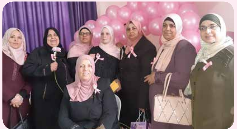
Sunrise cancer support group members October 2019

“ BREAST CANCER IS THE MOST COMMON CANCER AMONG WOMEN IN PALESTINE (APPROXIMATELY 34/100,000 [PALESTINIAN MINISTRY OF HEALTH 2018]) AND MOST WOMEN THERE PRESENT WITH LATE STAGE DISEASE. ”