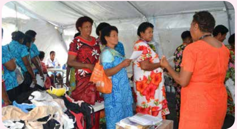
“Awareness with a Gift” event