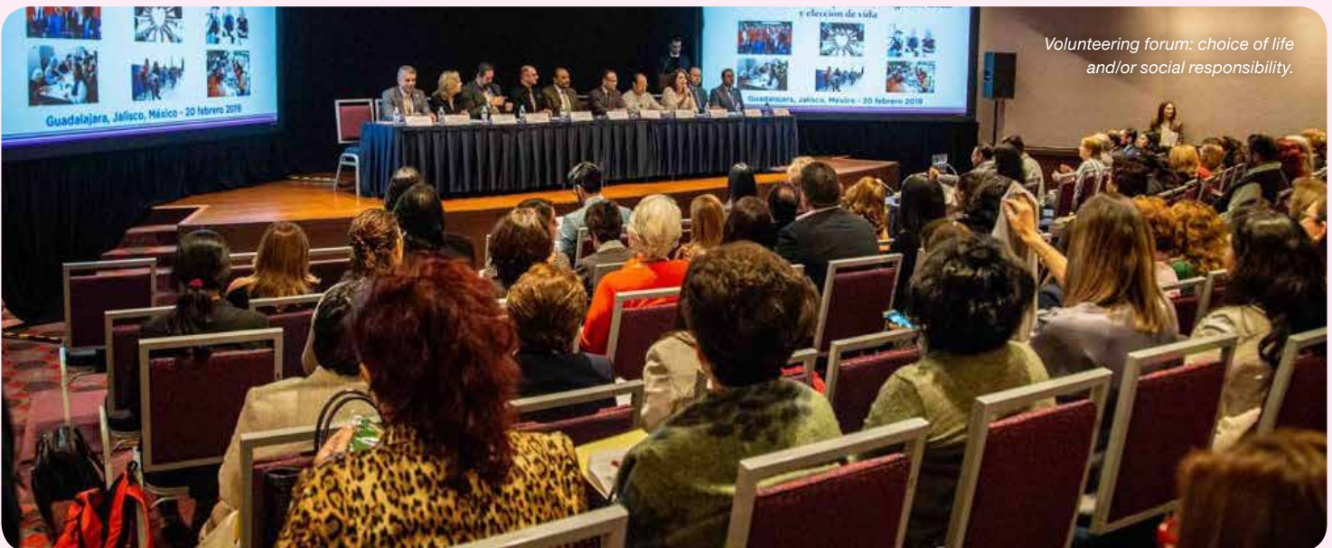
Volunteering forum: choice of life and/or social responsibility.

Through its intervention schemes, CF provides Fundación Voluntarias Contra El Cáncer with technical tools and other useful resources to fully achieve sustainable strategic plans. CF also works with other CSOs to support the social and economic empowerment of women who live in vulnerable conditions in the metropolitan area of Guadalajara.