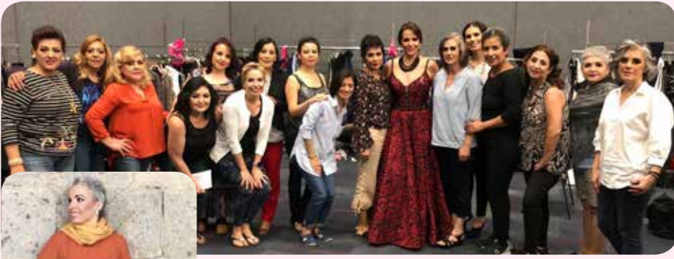
Women participating in the Cena Gala Pasarela.