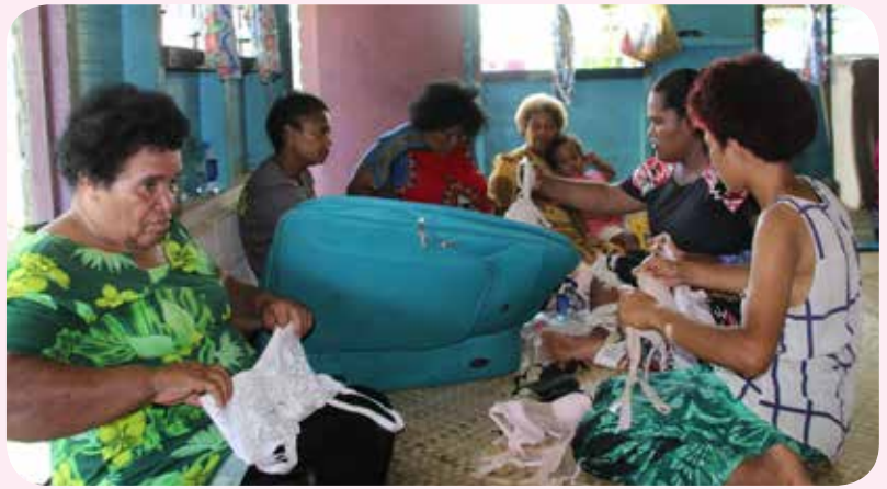
“Awareness with a Gift” recipients