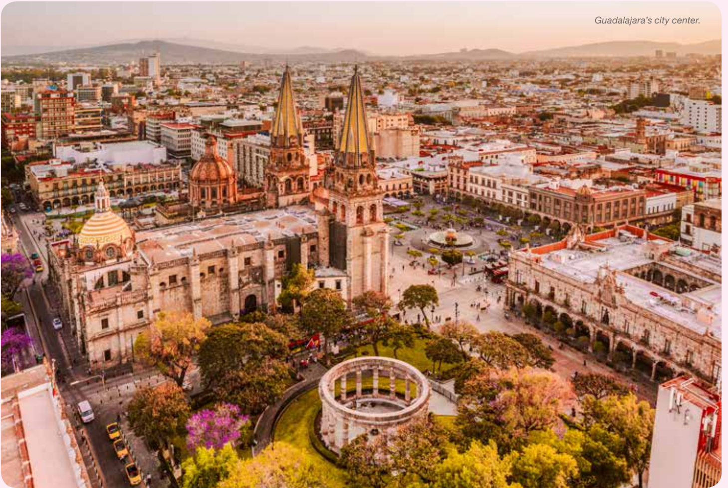
Guadalajara's city center.