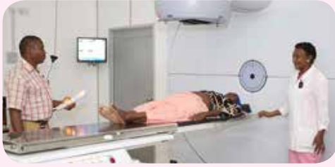
Tanzania's population is nearly 52 million, similar to England's, but the East African country has very limited imaging services, including mammography. Radiation therapy is available at only two national hospitals. Chemotherapy is available at the three national hospitals and at two of four zonal hospitals. No breast surgeon specialists work in the country, which also experiences chronic shortages of morphine.