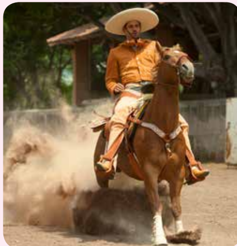
A participant in a Charrería, or Mexican rodeo.

These are but a few of many attractions Guadalajara has to offer. This vibrant city exists in its flavors, smells, and sights, and there are uncountable memories and stories yet to be told. The adventure awaits you.