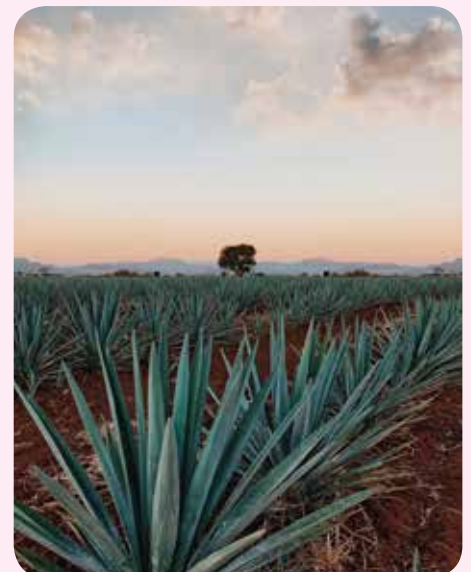
An Agave field in the town of Tequila, just outside Guadalajara.