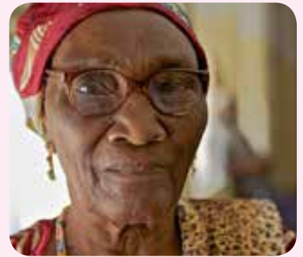
Breast cancer is the second leading cause of cancer mortality among women in Tanzania. The Breast Health Global Initiative, founded by Fred Hutch and Susan G. Komen, is working to improve outcomes for women here and in many other countries around the world.