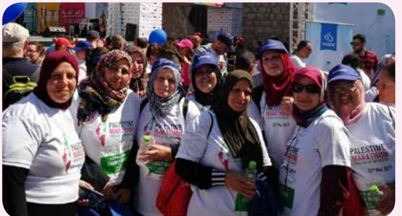
Sunrise cancer support group participating in the Palestine marathon – a first for these great ladies! March 2019