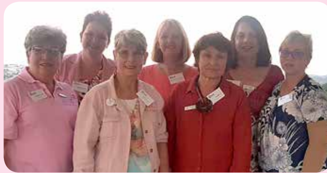
Reach for Recovery South Africa volunteers attending the WeCan Summit in Johannesburg