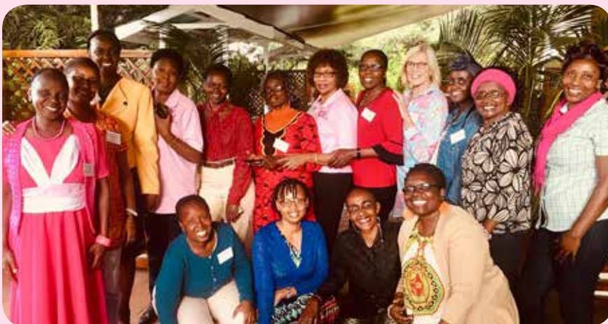
Participants at the Reach for Recovery training programme in Nairobi